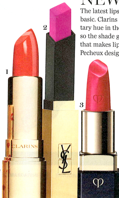
1. CLARINS Jolie Rouge Gradation in 801, $30. 2. YSL BEAUTÉ Rouge Pur Couture the Slim Lipstick in Fuchsia Excentrique, $39. 3. CLÉ DE PEAU BEAUTÉ Lipstick Cashmere in Entrapment, $65.

The latest lipstick bullets are anything but basic. Clarins inserted a brighter, complementary hue in the center of its new lipstick, so the shade goes on with a contoured effect that makes lips look fuller. Makeup artist Tom Pecheux designed the slim, squared-off shape of YSL’s new color to make it easier to get a sharp edge to your lip line, especially around your Cupid’s bow. And the wavy tip of Clé de Peau’s new design may not have practical implications, but it does deliver long-wearing matte color in one literal swoop. —J.G.