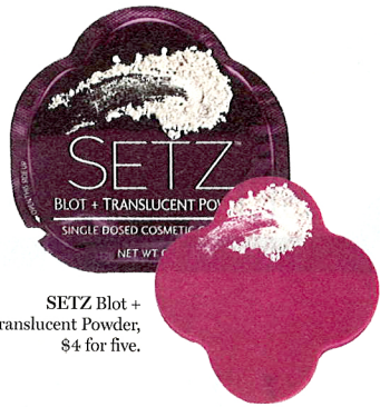
SETZ Blot + Translucent Powder, $4 for five.